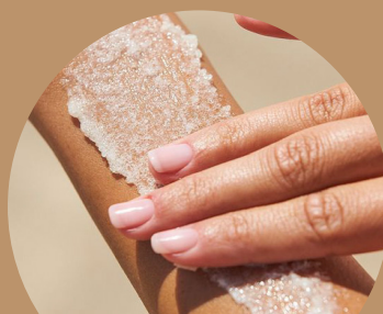
BATH, BODY & SKINCARE