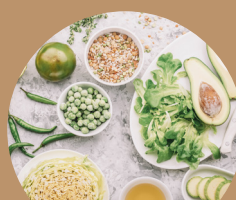
HOW TO EAT WELL ON A PLANT-BASED DIET