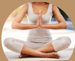
STRESS & SELF-CARE: HOW TO COMBAT STRESS