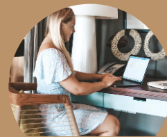
HOW TO STAY HEALTHY WHEN WORKING FROM HOME & INCREASE PRODUCTIVITY