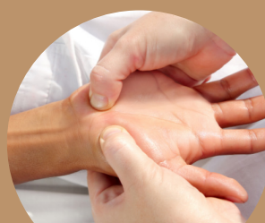
HAND OR FOOT REFLEXOLOGY