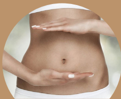
RESTORE YOUR GUT HEALTH