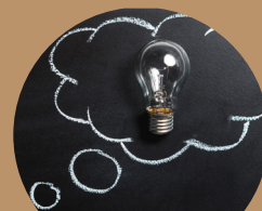
SUPPORTING YOUR MENTAL HEALTH: HOW TO BOOST MOOD, FOCUS & BRAIN FUNCTION WITH THE POWER OF NUTRITION