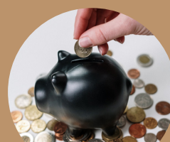
HOW TO EAT WELL ON A BUDGET

See the back of brochure for the breakdown of each talk.