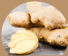
HOW TO SUPPORT YOUR IMMUNE SYSTEM NATURALLY