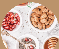
HOW TO HOLD A HEALTHY RELATIONSHIP WITH FOOD